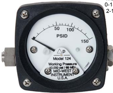
Model 124 0-150 PSID 2-1/2" Dial

A low cost differential pressure gauge for use in measuring the pressure drop across filters, strainers, separators, valves, pumps, chillers, etc., and for local flow indication and control.