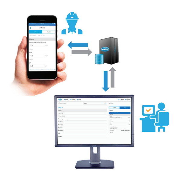
Accurate field data collection, available to authorized users, anytime, anywhere, any device.

Using Claros Collect or WIMS, authorized users can view and analyze data entered by others.