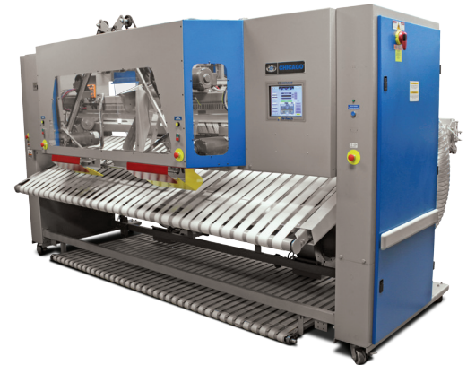
Bypass Conveyor In Raised Position For Use