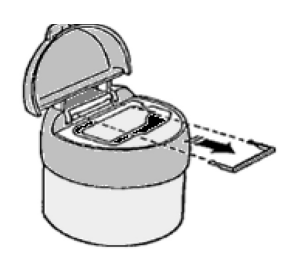
Lift the lid. Using a small screwdriver blade, carefully remove the pulser clip