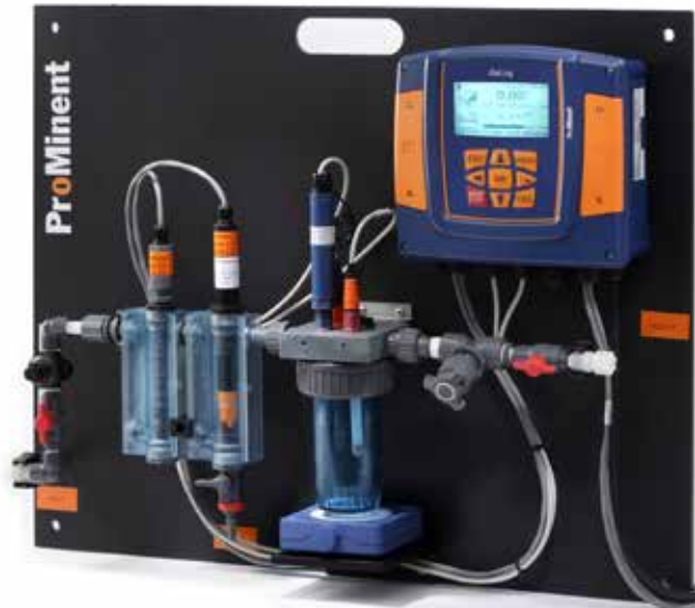
Fluoride/Total Chlorine Package

ProMinent® analyzers and controllers provide precise monitoring and control of process variables for potable water and wastewater applications. Our Reagent-Free amperometric sensor technology utilizes an on-line measurement of disinfection chemicals while using no colorimetric reagents or photometric equipment.