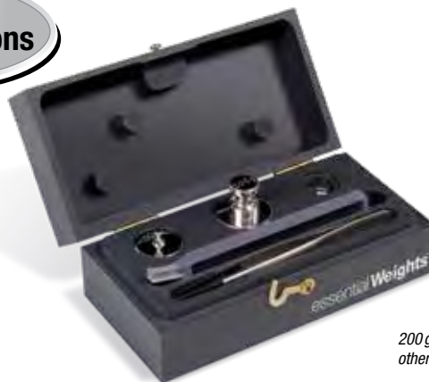
200 g PVC set shown, other sets will vary