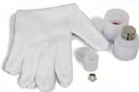
One Piece and Milligram Kits