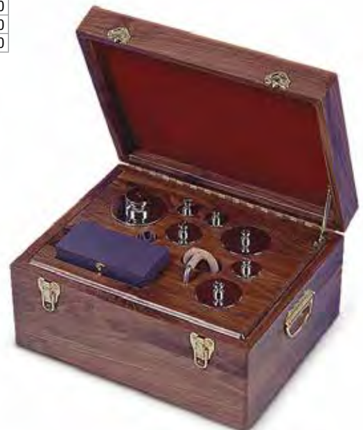
Set includes lifting device and gloves