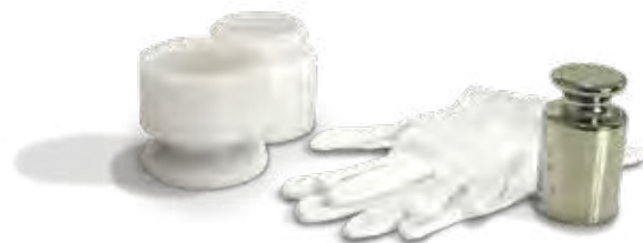
One Piece Kit