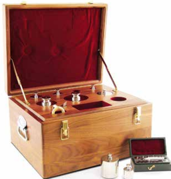
Set includes lifting device and gloves PN 12485 10 kg to 1 mg