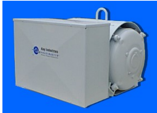
Model PI-80, 30HP Converter with Nema 3R control cabinet

The Phasemaster ® Type PI converter is unlike any in its class. The professionally engineered design and high quality construction is evident at a glance. The converter carries a CSA/UL equivalent approval. It is completely self-contained and does not require separate capacitor panels or adjustments. The convenient side-mounted control box houses the input-output terminals, and the optional disconnect switch, fuses and controls.