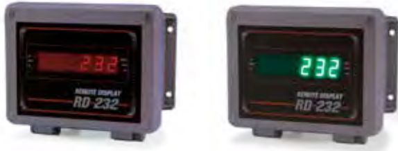
RD-232 NEMA Type 4X FRP Enclosure