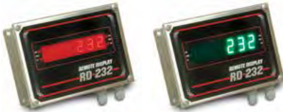
RD-232 Compact Stainless Steel Wall Mount Enclosure