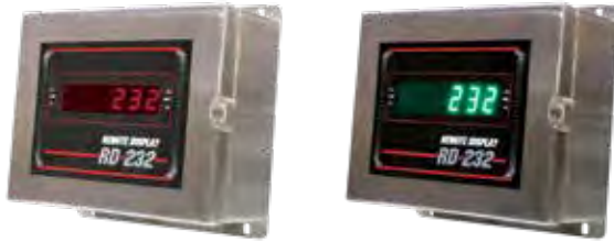
RD-232 NEMA Type 4X Stainless Steel Wall Mount Enclosure