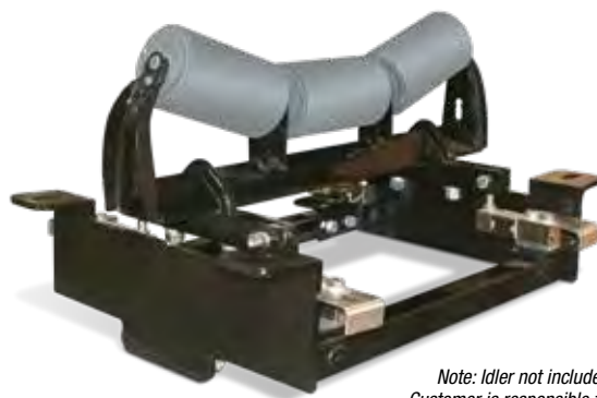
Note: Idler not included. Customer is responsible for mounting idler to weigh frame.

Guidelines assume clean belt with automatic tensioning system. Accuracy guidelines are typical. System accuracy may vary depending on environmental influences.