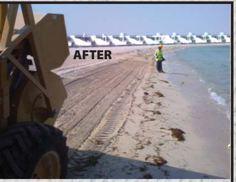
CHERRINGTON BEACHCLEANERS QUICKLY TRANSFORM BEACHES