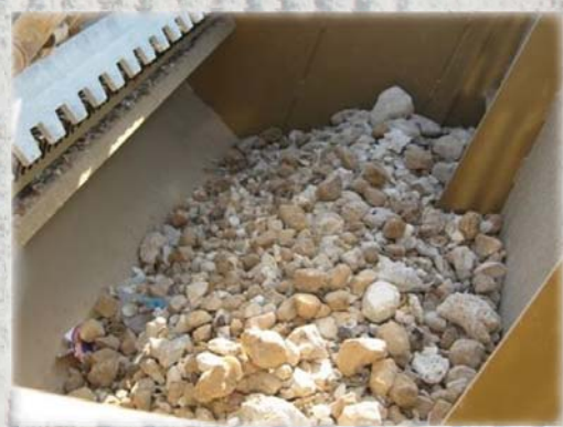
THE PROOF IS IN THE HOPPER Whatever your beachcleaning challenge - rock, coral, shells, construction debris, trash or seaweed - with Cherrington it is no problem!