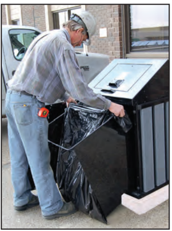
Front loading and unloading doors allows for placement against buildings.