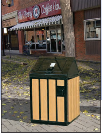
Aesthetically pleasing for feature developments.

Optional concrete pad with proven anchoring system.