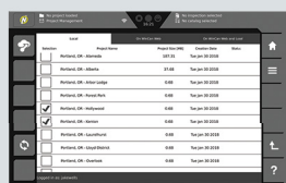
WinCan Web upload