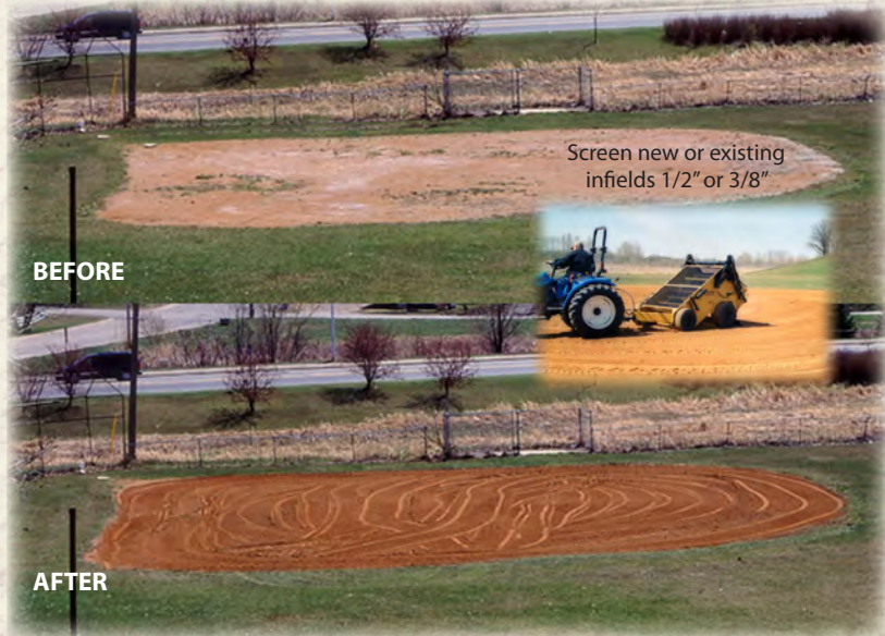
Screen new or existing infields 1/2" or 3/8"