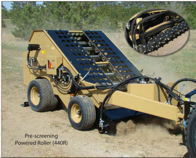
Pre-screening Powered Roller (440R)