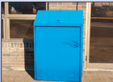
Front / Rear Unloading.