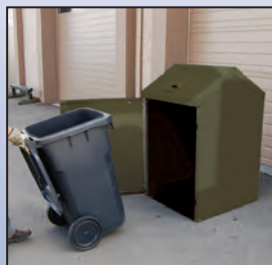
Houses all 32, 65 and 95 gallon poly carts.