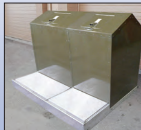
Modular design allows for a clean look with multiple units.

Bear resistant latches on loading and unloading doors.