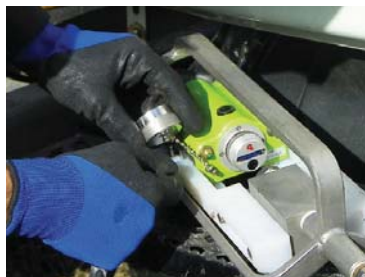
With the waterproof cap removed, the SD card, charging connector (bottom) and record enable switch (red, at top) are all visible.