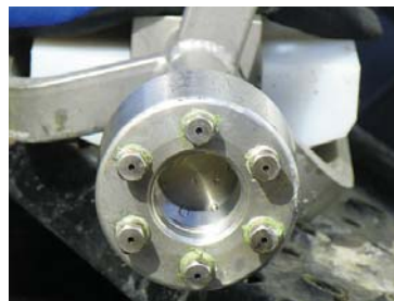
The six rearward facing jets are used to propel the JetScan (shown on truck step) down the line.