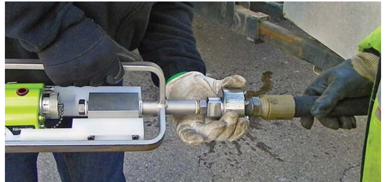
The JetScan's receiver is secured to the Jetter hose. The large diameter receiver allows sufficient "hand tightening" without the need for tools.

The on button was pushed, and following a simple lights-on/device-on check, deployment began. Intro-