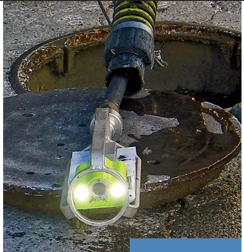
The JetScan is ready for deployment. The hose guard protects the jetter hose from chafing as it enters the potentially rough-edged sewer pipe.