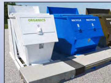
Designed to work with existing container footprint.

Galvanneal steel panels and an Axalta powder paint finish ensures a long life, for lower lifecycle costs & total cost of ownership.