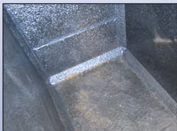
Interior armothane coating retains moisture and prevents corrosion.