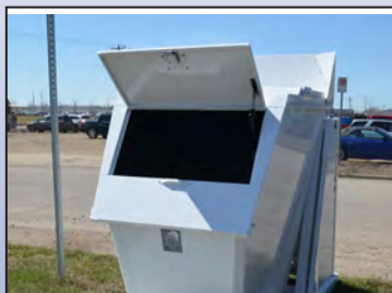
Optional loading door prop for easier material loading.