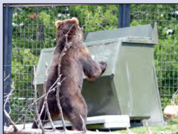
Hyd-A-Way is our original BearTight container, bear tested and certified!