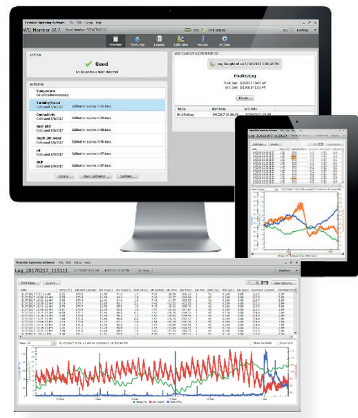
Quickly View Trends

Quickly view the current status of the instrument to ensure proper functionality