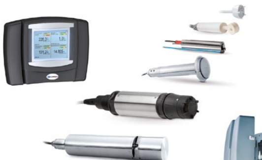
Controllers and sensors for on-line analysis and cost-saving process optimization

Benchtop and portable instruments for lab analysis Inspection, maintenance, and equipment qualification services available