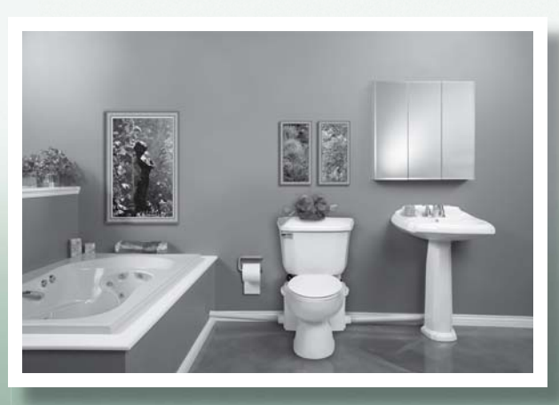
No need to raise the floor in your basement. The Qwik {\sf Jon}^{\it I\!\!R} Ultima installs behind the toilet.

The Qwik Jon<sup>®</sup> Ultima can be installed either freestanding or behind a wall with the 2" MPT or 1-1/2" internal slip side inlets.