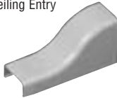
BFT-CE03W Ceiling Entry