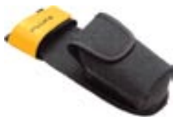
H3 Clamp Meter Holster