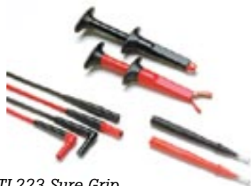
TL223 Sure Grip Electrical Test Lead Set