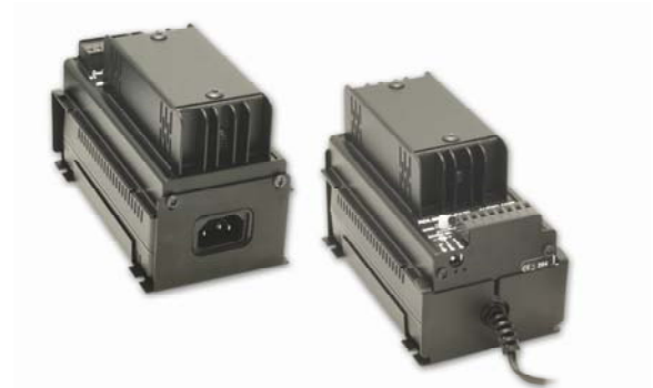
FP-PSB1 with PS-24U2 power supply and FP-PA20 audio amplifier mounted