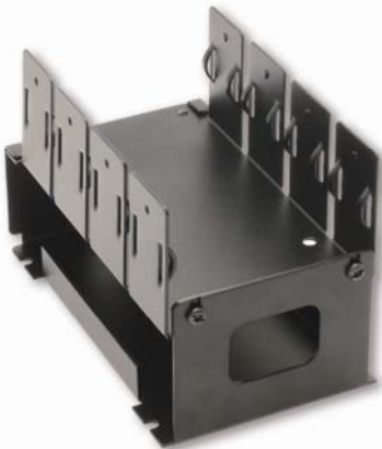
FP-PSB1 Power Supply Bracket with PS-24U2 mounted