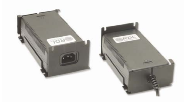
FP-PSB1 Power Supply Bracket with PS-24U2 mounted

The FP-PSB1 mounts to any flat surface or in an RDL Flat-Pak series rack mount panel (FP-RRA or FP-RRAH). The design of the FP-PSB1 allows it to slide into the Flat-Pak rack mount track. Mounting the FP-PA20 power amplifier (or other RDL modules using available adapter) together with the power supply conserves rack space and produces a convenient and professional installation.