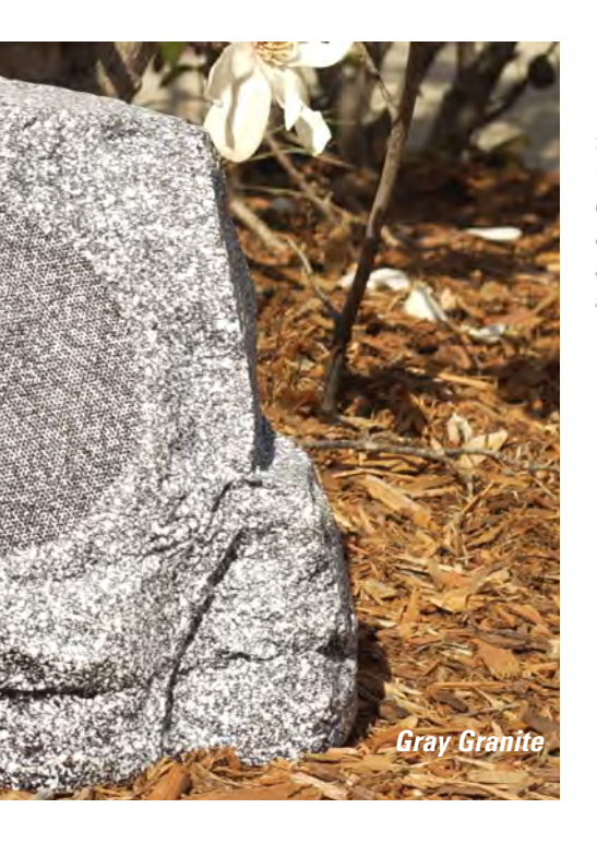
The rocks were tested in all types of weather and adverse conditions, such as humidity, salt spray and submersion in water.

Whether entertaining friends and family, taking care of the landscape, or simply relaxing, the atmosphere outside of your home is just as important as indoors. Now you can enjoy your favorite music without adding unsightly speakers. Designed specifically for outdoor use, these unique speakers not only sound best outside, but also fit with your landscape.