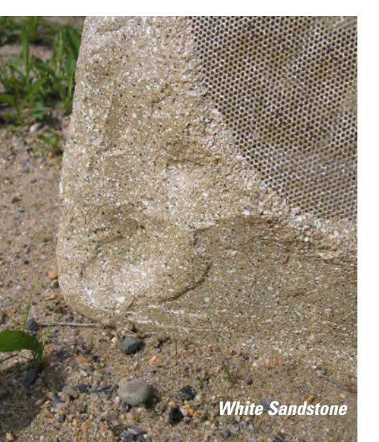
Each enclosure is cast with glass-reinforced resin to provide a sturdy cabinet providing years of enjoyment.