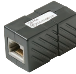
310-039BK Black 310-039WH White

See Steren Catalog pg. D12 for more products in this category