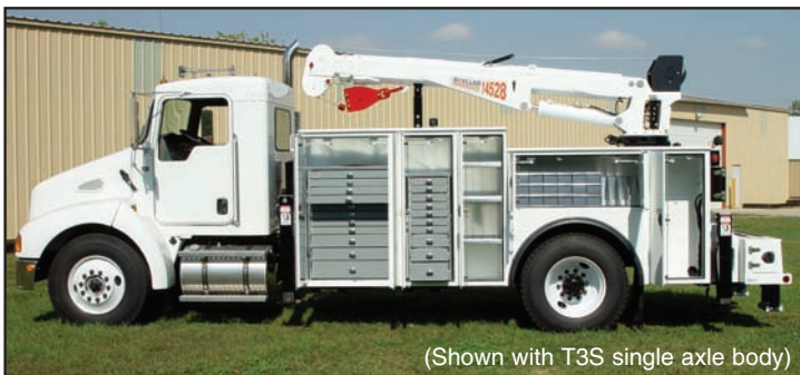
(Shown with T3S single axle body)

The Stellar 14528 features the Crane Operating Protection System (C.O.P.S.). This state-of-the-art technology measures load, coupled with the degree of boom elevation, and automatically limits functions of the crane to the values on the capacity placard so that overload conditions are not possible. Repositioning the load by lowering, retracting the extension, or booming up will allow for continued use of the crane.