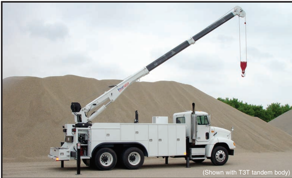
(Shown with T3T tandem body)

The 14528 telescopic crane was developed as a result of Stellar customer demand for greater reach and increased capacity. This crane will serve the increasing demands of heavy equipment dealers, the mining industry and large construction companies who operate large fleets with even larger equipment needing service. Stellar developed the 14528 with industry first features, such as the full hydraulic reach to 28 feet! No other North American crane manufacturer has this kind of capacity with this kind of hydraulic reach. The 14528 is a 70,000 foot/pound rated crane that can lift a maximum of 14,000 pounds at 5-feet and 2,500 pounds at 28-feet. Other unique features of the 14528, and Stellar's other telescopic cranes, include hexagonal boom structure, standard variable-speed radio remote control, a planetary winch system with 60 feet per minute and a lighter shipping weight than most competitors.