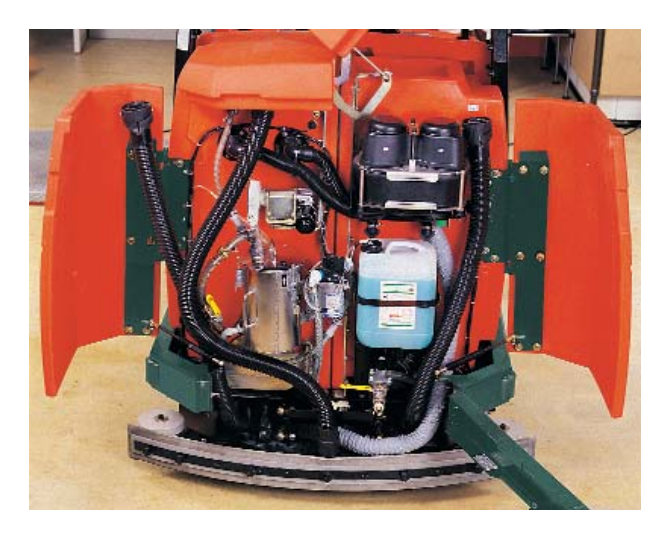
Direct access to all important parts and systems thanks to covers which can be opened for service and maintenance purposes. Pictured above for example, chemical metering system and dirty water recycling system.