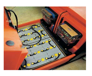
Environmentally-friendly battery drive. Quick exchange of battery trays in approx. 2 minutes with fork lift truck or lifting equipment