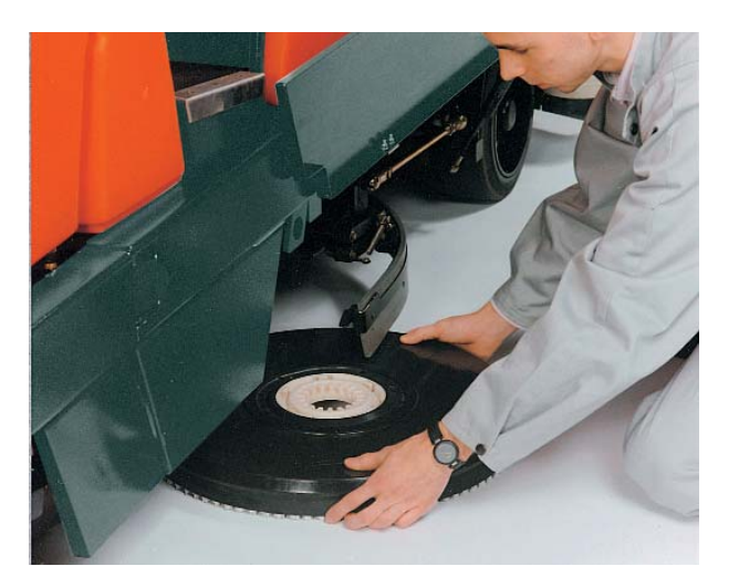
Excellent cleaning performance thanks to two directly driven disc brushes. Can be changed without additional tools. Up to 50% less water and cleaning chemicals used as a result of the Aqua-Stop-System.