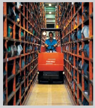
Without Pre-sweep: wet scrubbing and dry vacuuming, without a problem, even in narrow passageways/aisles.