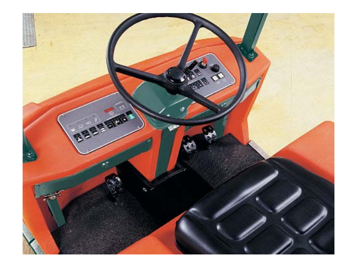
Optimum driver's seat, optimum view. Clear operating panel, visual information regarding all working functions/conditions. All working functions can be started at the press of a button.