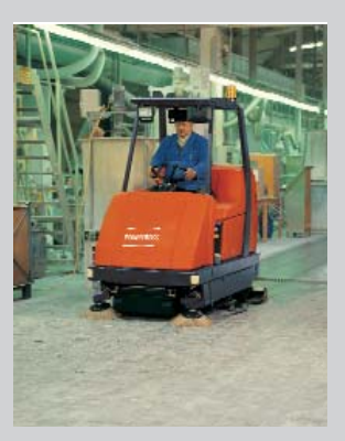
With Pre-sweep: even larger debris is kept under control "from the word go." Industrial cleaning really can be this quick and safe.