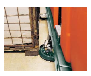
Suspended, floating side scrubbing unit (option) for working close to the edge, near walls, pallets and under shelves.