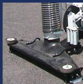
ABOVE 36/48 Inch Vacuum Head Assembly