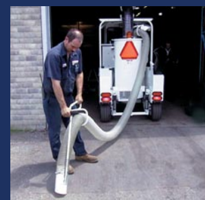
ABOVE 5" x 15' Retractable Wanderhose

Fenceline nozzle elbow ■ Ultraseal tire flatproofing ■ Broom & Rake Holder ■ Fire extinguisher ■ Diesel safety shut-down ■ Emergency stop button ■ Catalytic converter (exhaust purifier)