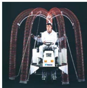
FAR LEFT Access litter on grass covered ground, asphalt or concrete.