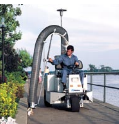
ABOVE Madvac 101 3-Wheel