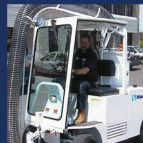
ABOVE Cab enclosure