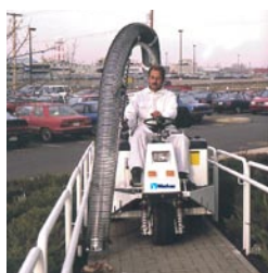
ABOVE Handle tight spots with ease