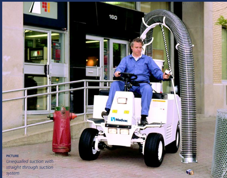
PICTURE Unequalled suction with straight through suction system