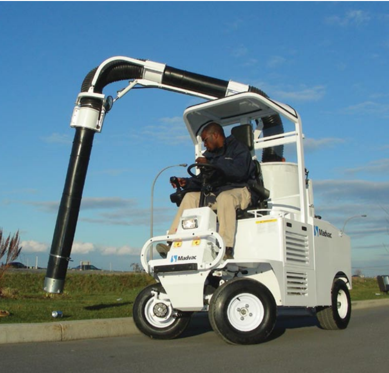
ABOVE New robotic arm controlled via a joystick