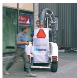
ABOVE Superior rear visibility