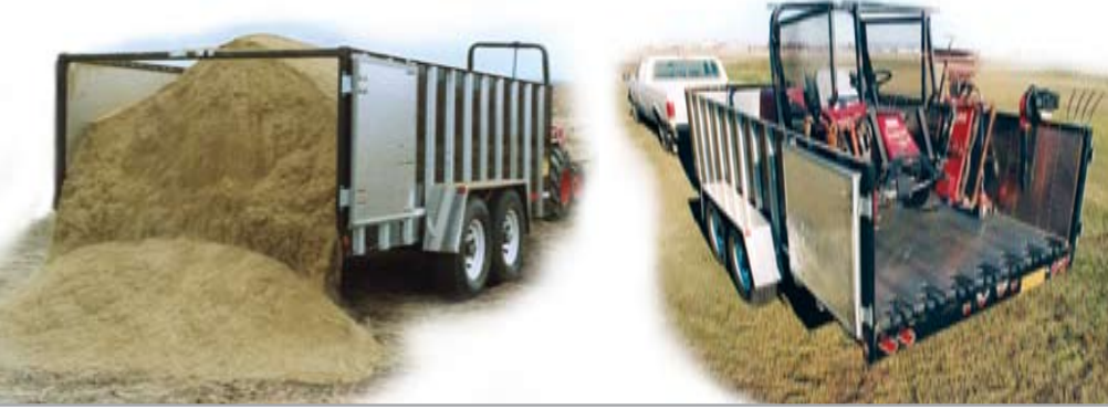
Patents Pending and Applied For.