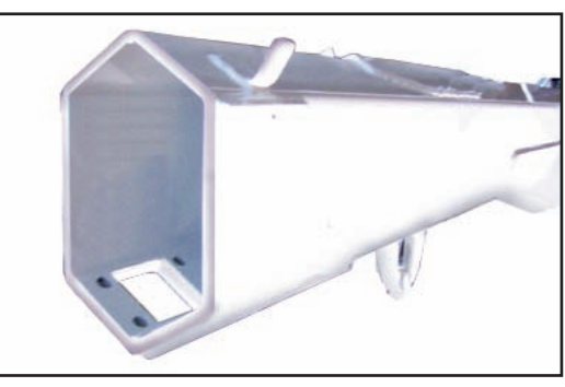
Above: Hexagonal boom construction provides a stronger cross section than square tubing. This reduces boom flex and side to side movement.