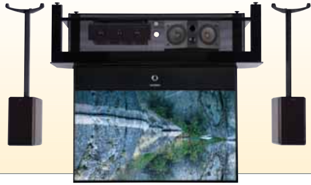
SFV65b | EF28b

Rigid strength and contemporary design in an affordable package. Now you can have the strength of steel without making your AV gear and room look like a warehouse. Heavy-gauge steel is powder-coated with a lasting and beautiful silver or black finish. Tops and shelves are made of extra-thick frosted or black glass to securely support most any TV and a full complement of AV components. Choose from four sizes – all with Sanus' trademark features such as a wire management path and adjustable feet.