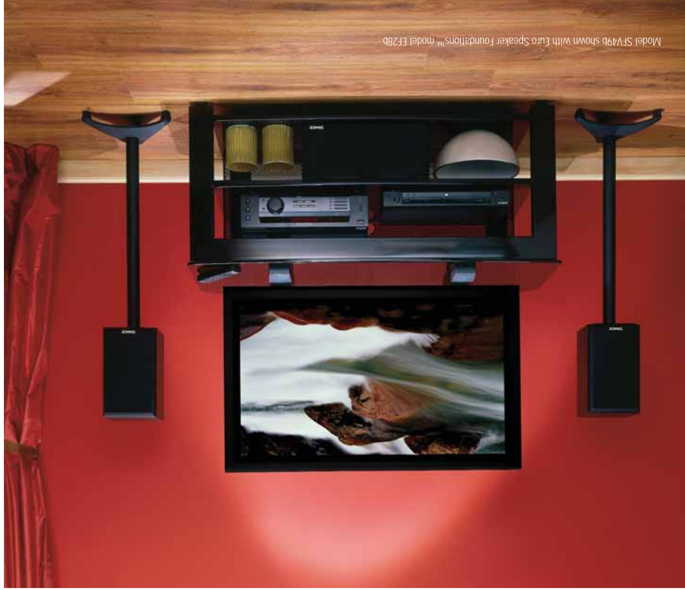
Model SFV49b shown with Euro Speaker Foundations™ model EF28b