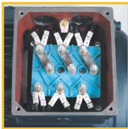
Globetrotter® Conduit Box and Terminal Block