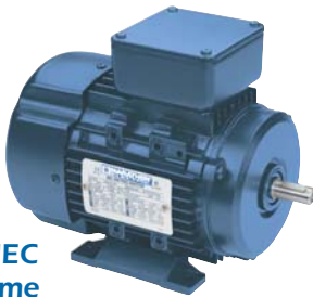
Globetrotter® IEC Aluminum Frame