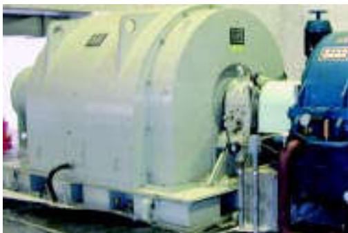
Customer: Bioenergia Cogeneradora/Usina Santo Antônio Country: Brazil Supply: 28,750 kVA, 13,800 V, 4 poles Application: Steam turbine (Sugar and alcohol plant) Fuel source: sugar cane waste Manufacturing date: 2002