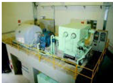
Customer: USINA COLOMBO Country: Brazil Supply: 18,750 kVA, 13,800 V, 4 poles Application: Steam turbine (Sugar and alcohol plant) Fuel source: sugar cane waste Manufacturing date: 2000