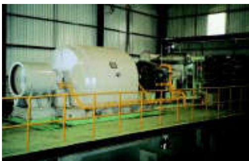
Customer: UNI-SYSTEMS End User: Engenho Monte Rosa Country: Nicaragua Supply: 18,750 kVA, 13,800 V, 4 poles Application: Steam turbine (Sugar and alcohol plant) Fuel source: sugar cane waste Manufacturing date: 2001