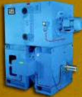
DC motors Output ratings from 0.5 to 3000 kW