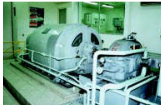
Customer: URBANO AGROINDUSTRIAL S.A. Country: Brazil Supply: 3750 kVA, 13,800 V, 4 poles Application: Steam turbine (Rice processing plant) Fuel source: rice shell Manufacturing date: 2000