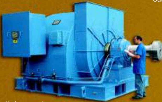
Hydrogenerators Output ratings up to 25,000 kVA Voltages up to 13.8 kV