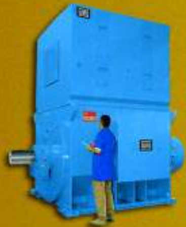
Synchronous motors Output ratings up to 22,000 kW Voltages up to 13.8 kV