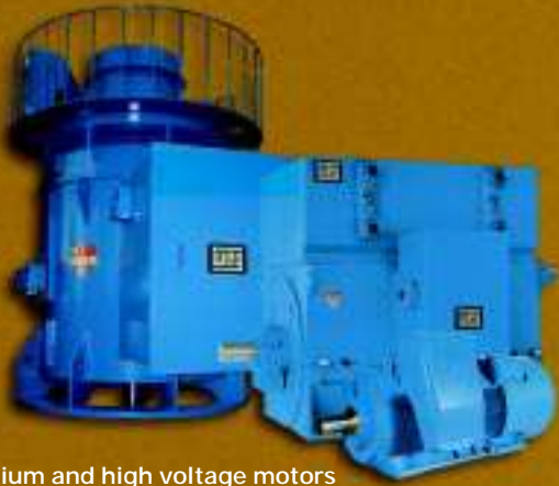
Medium and high voltage motors Output ratings up to 22,000 kW Voltages up to 13.8 kV