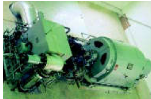
Customer: TERRANOVA Country: Brasil Supply: 3750 kVA, 13,800 V, 4 poles Application: Steam turbine (Lumber processing plant) Fuel source: wood waste Manufacturing date: 2002