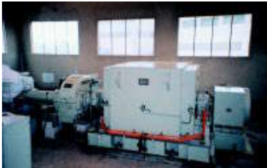
Customer: SANTA ADELIA Country: Brazil Supply : 42,500 kVA, 13,800 V, 4 poles Application: Steam turbine (Sugar and alcohol plant) Fuel source: sugar cane waste Manufacturing date: 2002