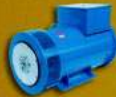
Generators for generator sets Output ratings up to 4200 kVA

WEG can also offer cabinets, panels, monitoring systems and transformers designed to meet the most demanding technical requirements on applications of Generation and Distribution of Energy systems.