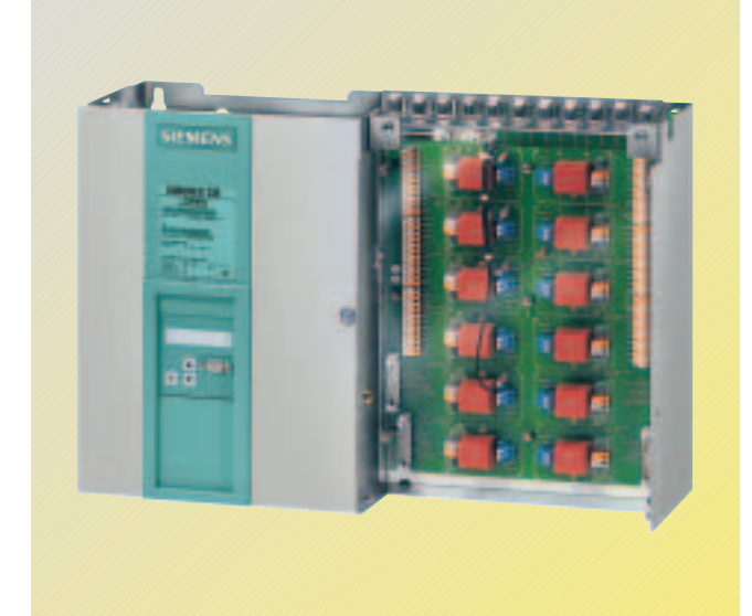
Fig. 6/1 SIMOREG CM

An important application for the SIMOREG CM converter is in the retrofitting and modernization of DC drives in existing systems.