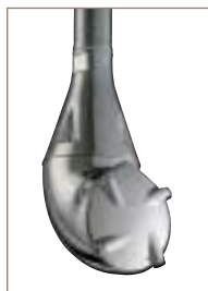
Toftejorg TJ 20G • 360° impact cleaning and coverage • Award-winning hygienic design