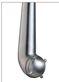
Toftejorg SaniJet 20 • Totally self cleaning • Follows EHEDG guidelines • FDA compliant • High-impact cleaning

The complete coverage, rotary action and impact afforded by rotary jet heads makes them particularly effective in cleaning viscous, foaming or thixotropic products of the type commonly produced in the personal care industry. The efficient removal of such residue also grants significant savings in terms of time and water consumption.