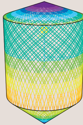
Wetting Intensity (l/m 2 )