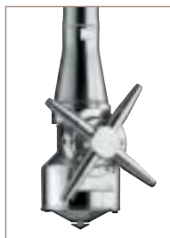
Toftejorg TZ-74 • 360° impact cleaning and coverage • Effective cleaning at low flow rate