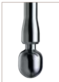
Toftejorg SaniMidget • Full coverage • Effective cleaning at low flow rate • Sanitary design