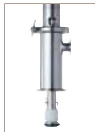
Toftejorg SaniMidget Retractor • Retractable • Suited to tanks with internal components • Self cleaning and self draining