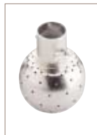
LKRK Static Spray Ball • DIN and ISO connections • Sanitary design