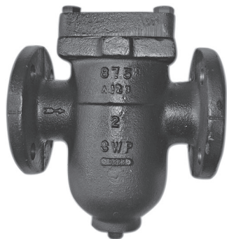
Models 165-B, 166-B

165-B Bronze Class 150 166-B Bronze Class 300