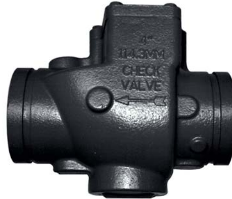
Tech Data: G350