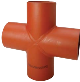
Figure 927 Cross