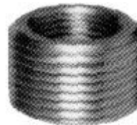
PENN CATALOG F2002 FIG NO. 06012 ASME-B16.11-2001