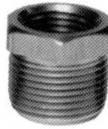
PENN CATALOG F2002 FIG NO. 06011 ASME-B16.11-2001