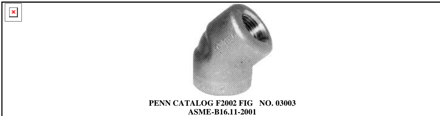
PENN CATALOG F2002 FIG NO. 03003 ASME-B16.11-2001