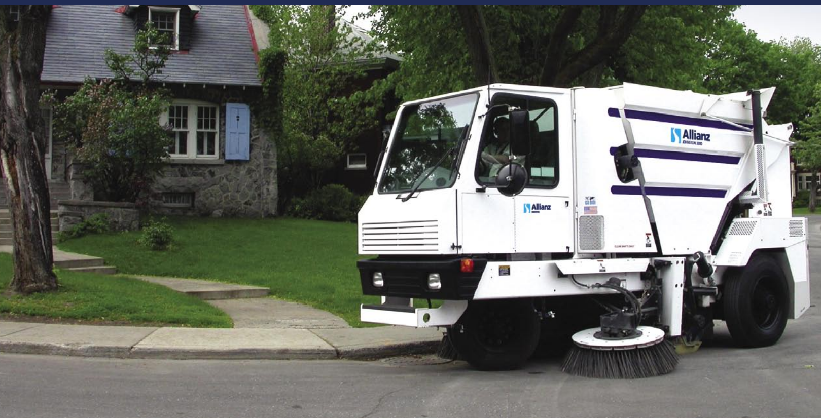
BELOW In-cab control makes bulkier debris pick-up easier