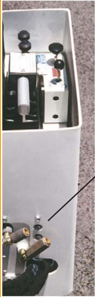
Single- or dual-hydraulic tool outlets