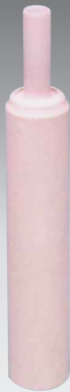
Slim Gallium Cell