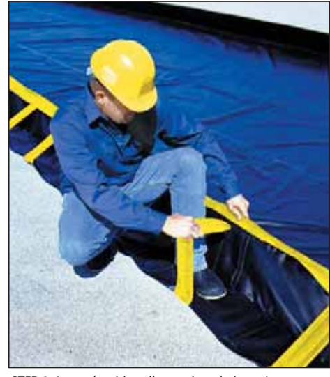
STEP 2: Insert the sidewall struts into their pockets. Compact Berms are ready to go!