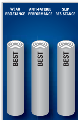
RESULTS from INDEPENDENT TEST LABS & PRESENTED as COMPARISONS to OTHER NoTRAX® FOOD SERVICE MATS