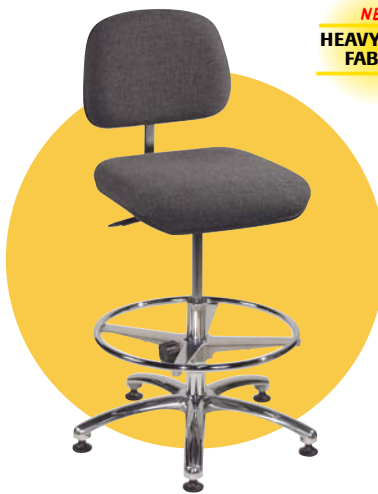
Standard Upholstered ESD Chair