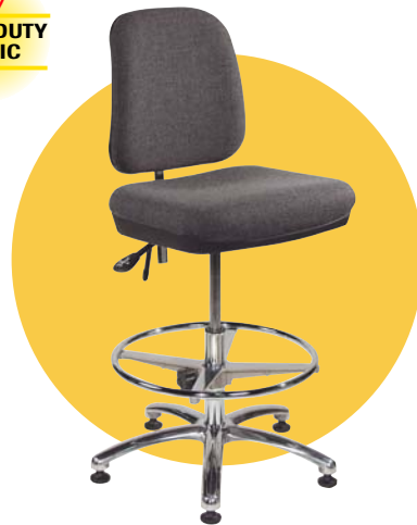
Deluxe Multi-Function Upholstered ESD Chair