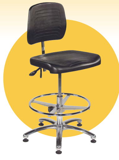
Deluxe Multi-Function Clean Room Chair with Large Contoured Seat

No. 2043CRN - Standard Chair No. 2071CR - Clean Room Casters