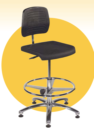
Standard Clean Room Chair