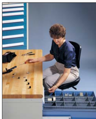
Drawers extend fully to easily reach stored items.