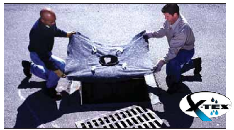
U.S. Patent No. 5,575,925