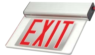
Double face utilizes a mylar insert