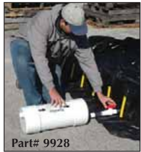
* At 2" WC (Head Pressure)