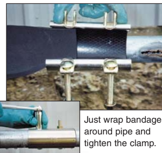
Just wrap bandage around pipe and tighten the clamp.

R-PIPE-L covers pipe sizes from 5" - 8", contains 3 patches.